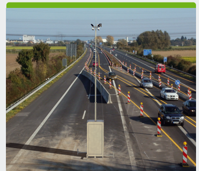
Traffic & Construction